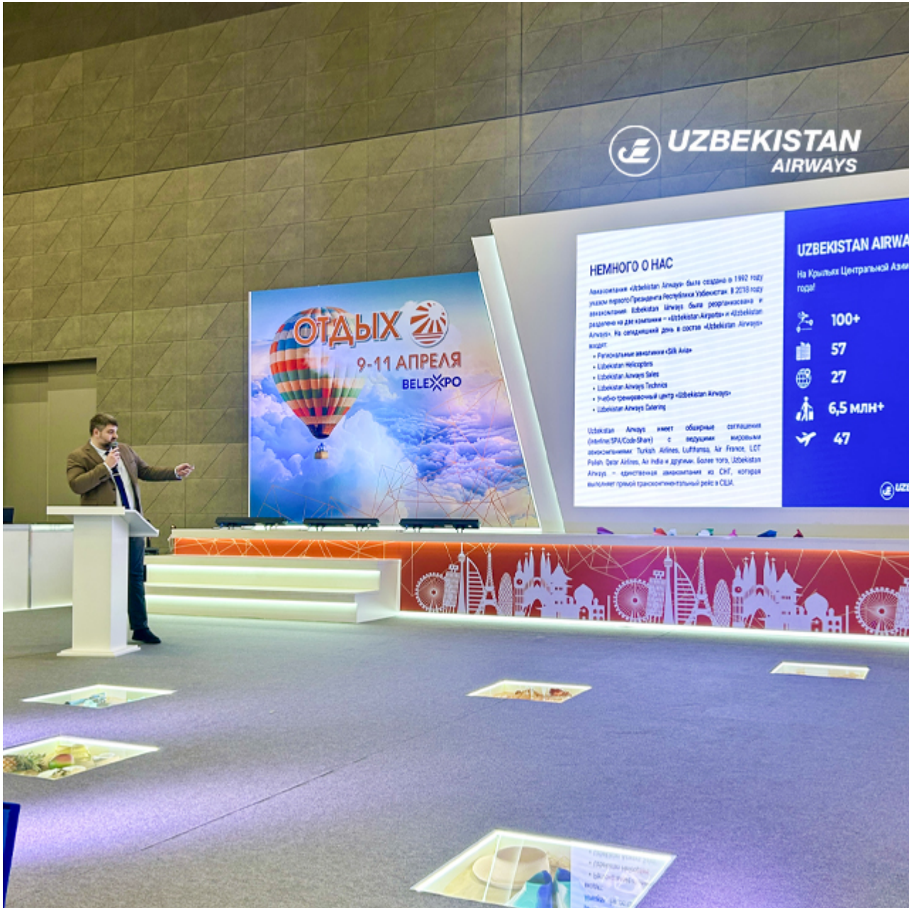
Flights on the Tashkent – Minsk – Tashkent route operate three times a week: on Mondays, Thursdays and Saturdays.