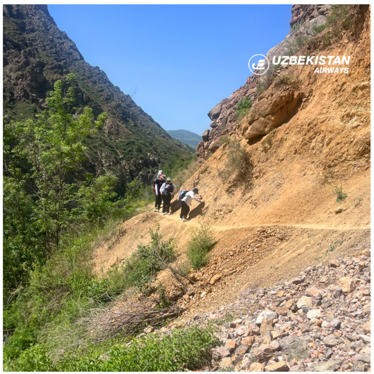
Organized with the support of the trade union committee and Uzbekistan Airways, the hike was part of our corporate culture that values not only professional excellence, but also team spirit, healthy living, and respect for the environment.